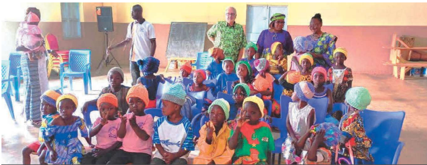
Some more of those hats at the Sunday School

We have bank accounts for USD and EUR. For donations in these (or any other currency), please ask for details.