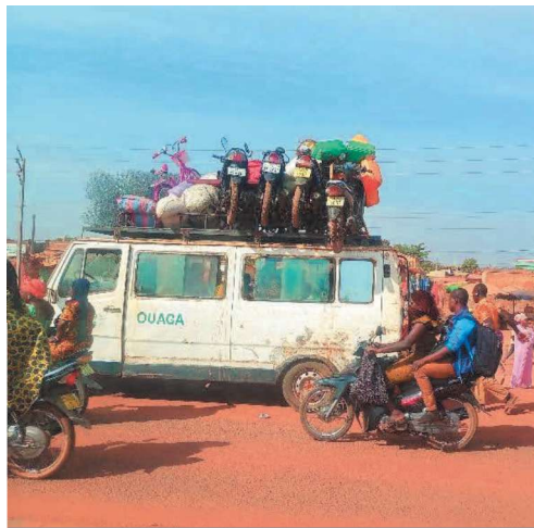
Local bus service to the capital.

Recently we have been waiting for over a month for the money to be available to use.