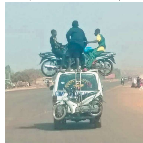
No room to sit inside? No problem!

However, recently, he has started to make changes that affect NGOs by introducing rules that were not at all helpful to us financially, and we are still in the process, as trustees in the UK, of considering how best we can adapt. We must add that changes he has made in the country have generally been well received by the people. So what’s going on?