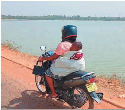
Health and Safety in Burkina Faso. This along the road by Tanghin Barrage where we stay.

report due to the very high production and postage costs, (which are covered by the trustees personally). However hopefully our website and Newsletters will fill any gap.