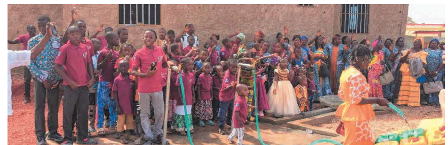
The church at Silmiougou where we have recently put a huge water tower.

There was a successful visit to Burkina Faso in January as usual, and a briefer than usual report is available from us. If you are a regular supporter you should receive it automatically, but if not you can