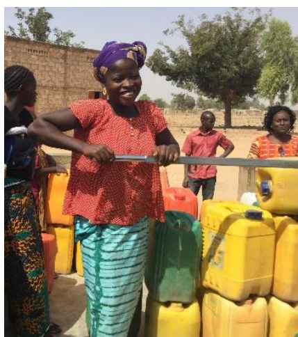
Figure 1 Busy well as Yagma

Visits to wells took us to a number of places around Ouagadougou and to the south west area, around the town of Gaoua. Despite not advertising our itinerary in advance, we found a welcome at each of the places we went. Many of them were places where wells had been provided during November and December 2019. We saw people (usually ladies or children) who had previously had to walk over 4km, there and back, to fetch water – now with clean water much closer. There were places where they had been forced to drink dirty water from rivers, ponds and marshes – now able to enjoy good clean water freely available.