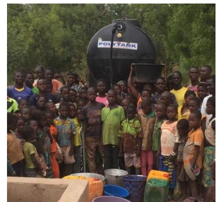
Figure 2 Tap in the village!

At one of the wells, water was too deep to use with the normal hand pump. It was just too heavy. There was a danger that the people would stop using it and return to using the river. Christine asked if we would consider installing a solar powered pump. This is now done and there is a small water tank kept topped up by the new pump, with a TAP! What a luxury to have one tap in the village!